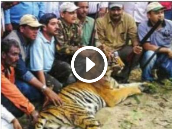
Forest officials with the carcass of the tigress

NAINITAL: Bringing to an end a search that lasted over 40 days and involved expenses of nearly Rs 1 crore, the elusive man-eating tigress who was stalking the area near Ramnagar was finally shot dead by a forest department shooter in Gorakhpur village on Thursday .