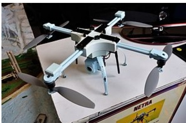
DRDO Netra Mini Unmanned Aerial Vehicle (UAV),Quadcopter ,Indian Armed Forces

This is the Indian indigenous mini-Unmanned Aerial vehicle used for surveillance and reconnaissance operations.It tooks its first flight on 3 July 2010 and introduced in service by 30 January 2012 and till now 24 prototypes are built.It is primary used by Central Reserve Police Force and Border Security Force.