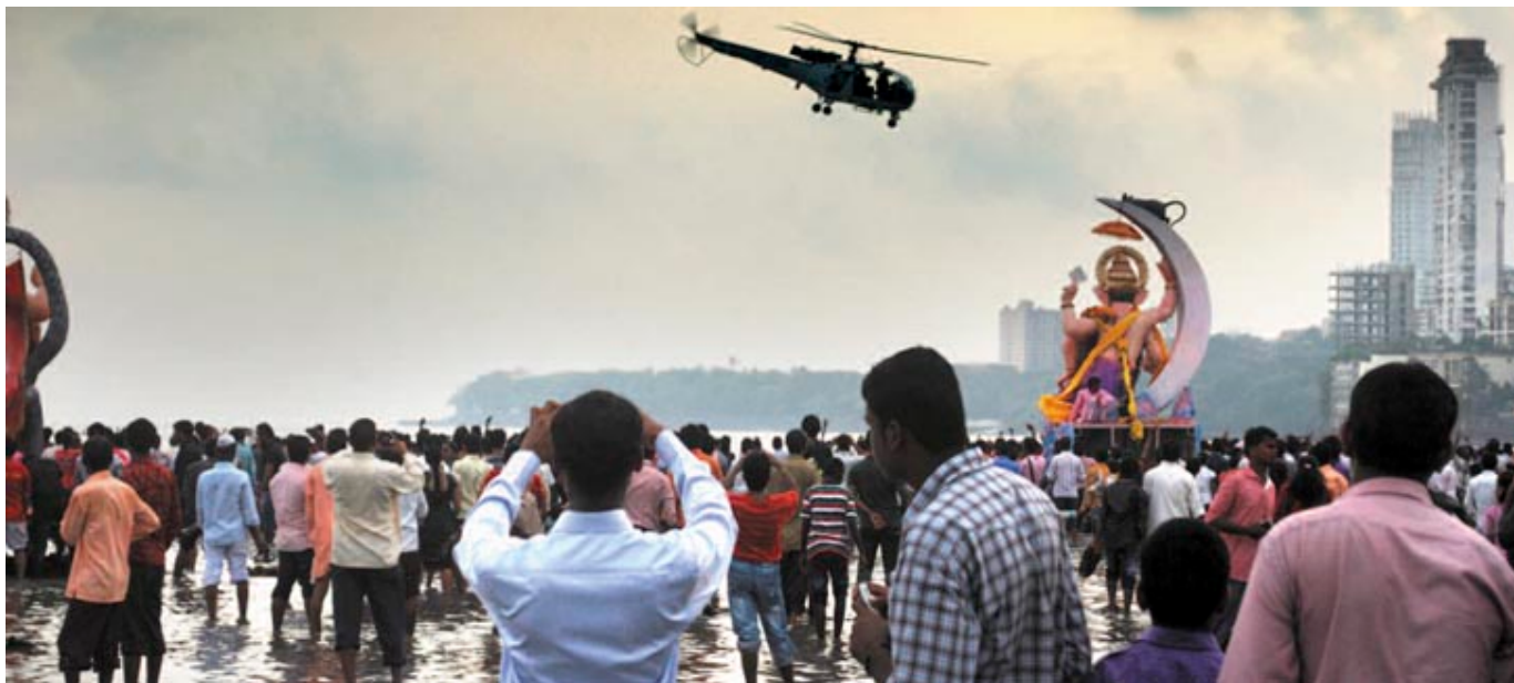
Drones enable aerial surveillance at a fraction of the cost of a chopper but cops say they are not of much help

— By Sindhu J Mansukhani , August 31, 2014 01:55 am