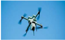
Photo : Netra UAV deployed in Mandi Beas search operation

Unmanned aerial vehicle Netra will scout for bodies of engineering students from Hyderabad who drowned in river Beas in Himachal Pradesh. The UAV, a prized possession of the NDRF 5th battalion, was used for search operations during the last year. "Netra can fly 2.5 km from take-off point and to a height of 100m with a battery back-up of 30 minutes. In case of a small malfunction or battery discharge, built-in fail-safe system allows it to return to take-off point even if communication is lost